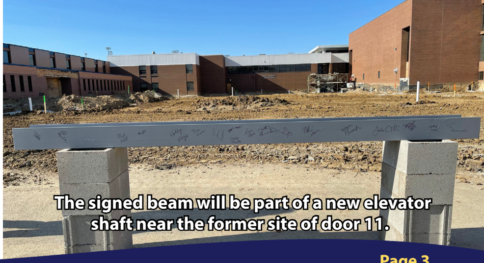
The signed beam will be part of a new elevator shaft near the former site of door 11.