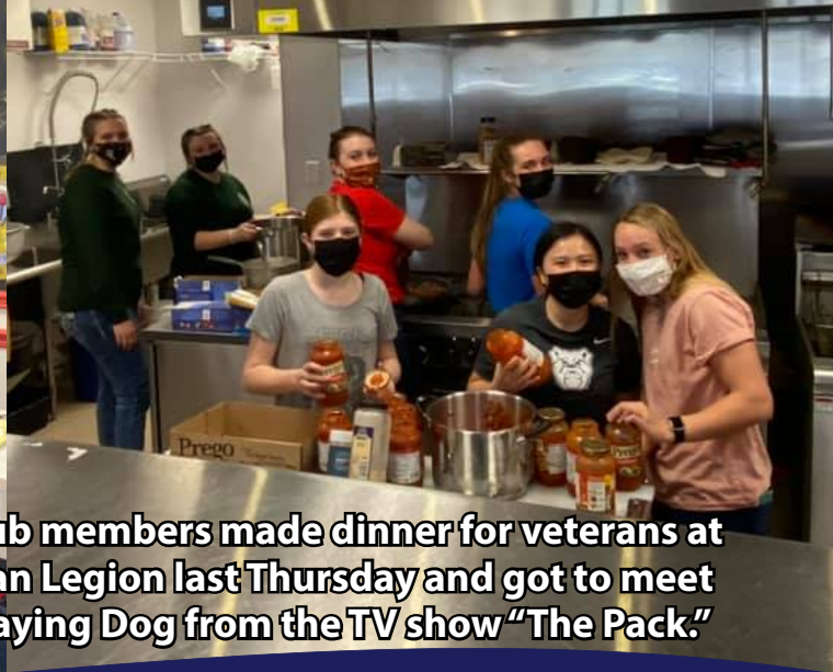
MHS Key Club members made dinner for veterans at the American Legion last Thursday and got to meet Dixie the Praying Dog from the TV show "The Pack."